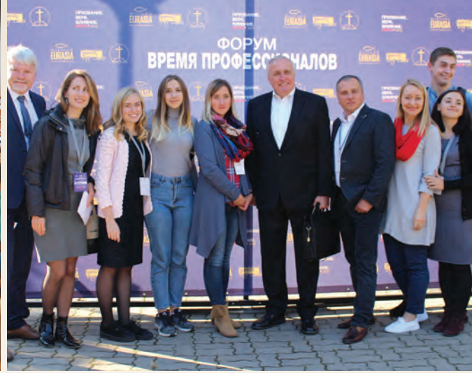
Next Generation Professional Leaders Forum, Minsk, Belarus